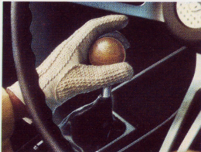
Short, fast, 4-on-the-floor gearshift designed for quick, positive changes.