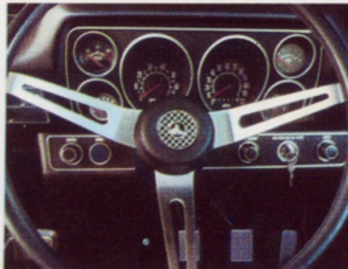
Tacho, speedo, oil pressure, water temperature, ammeter and fuel gauges.

What happens when you take a lean, lithe road machine, drop in a muscular 2850 cc. Holden 'six' that produces 130 hp from twin-barrel carburetion, tie it to an all-synchro floor mounted 4-speed, add dual exhaust manifolds and a low impedance air cleaner . . . and set it all on wide rally wheels and B70 boots? You'll find out when you drive a Torana GTR—if you can stop staring admiringly at it long enough to get behind the wheel.