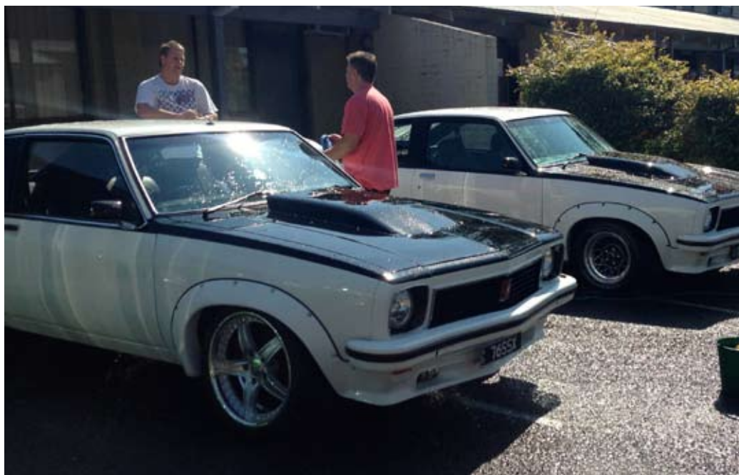
A couple of the bigger ones having a wash before the Saturday cruise..