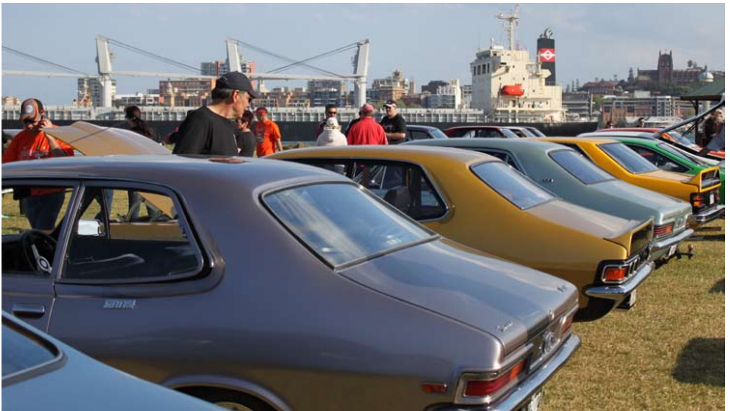
Cars line the foreshore at Stockton while a ship cruises by.