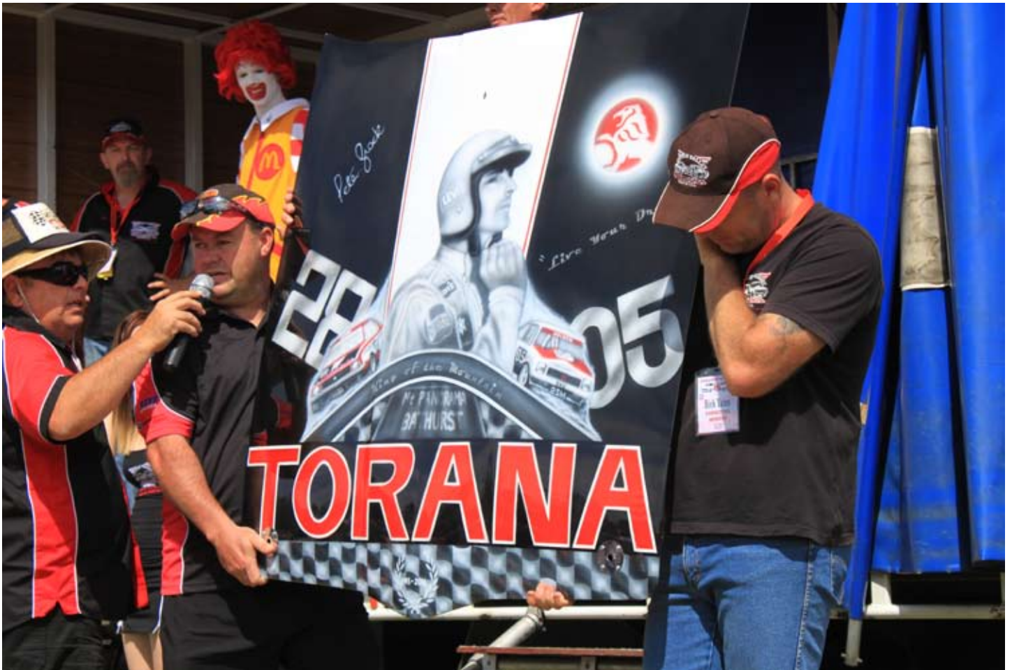
This bonnet was auction off for just over a $1000, great effort for charity.