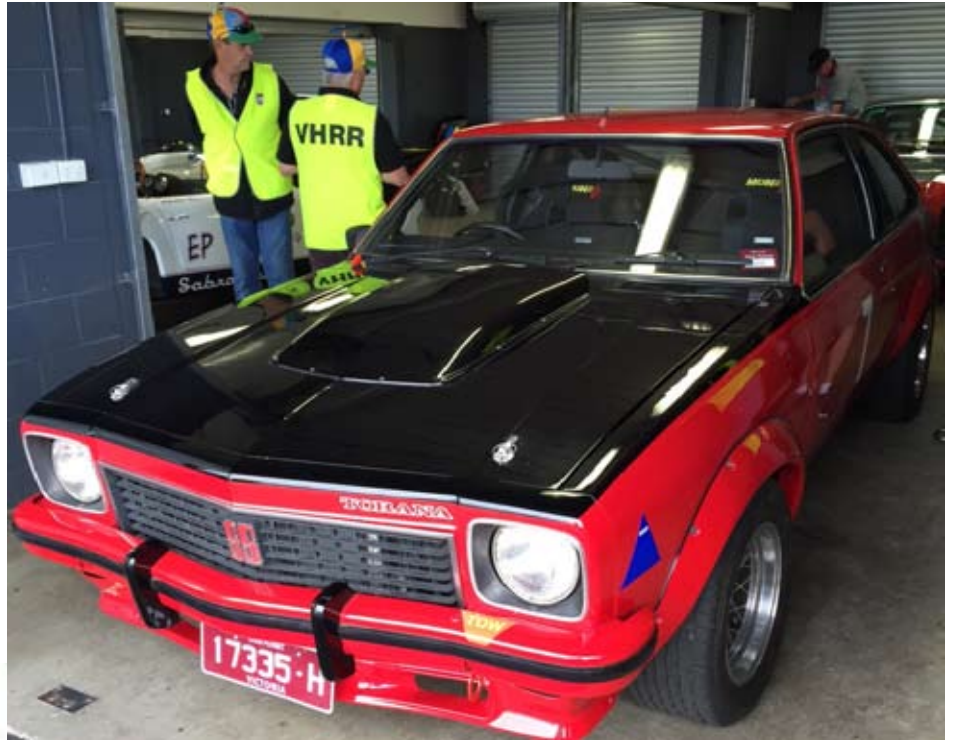
Feeling right at home sitting in the 24C car.